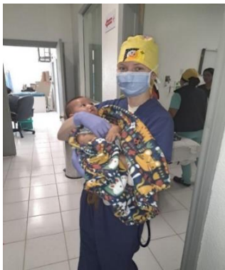
A fleece blanket in use somewhere in Mexico