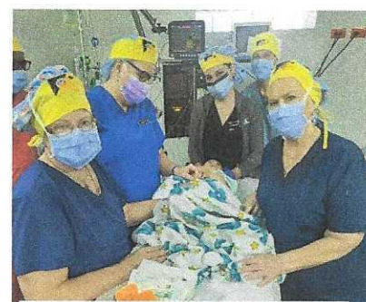
Fleece FOL Blankets being distributed to surgery patients in Mexico

Please consider to join the Busy Bees FOL Quilter's Team Soon! Soon several quilters will be leaving for the summer, so more helpers will be needed. If anyone prefers to sew projects at home, the Quilters can provide kits for anyone to do. If you can tie a knot, then you can easily join this talented group! See the Busy Bees FOL Quilters in action by coming to FOL on Wednesday mornings at 9 am, which meets at the east end of FOL's